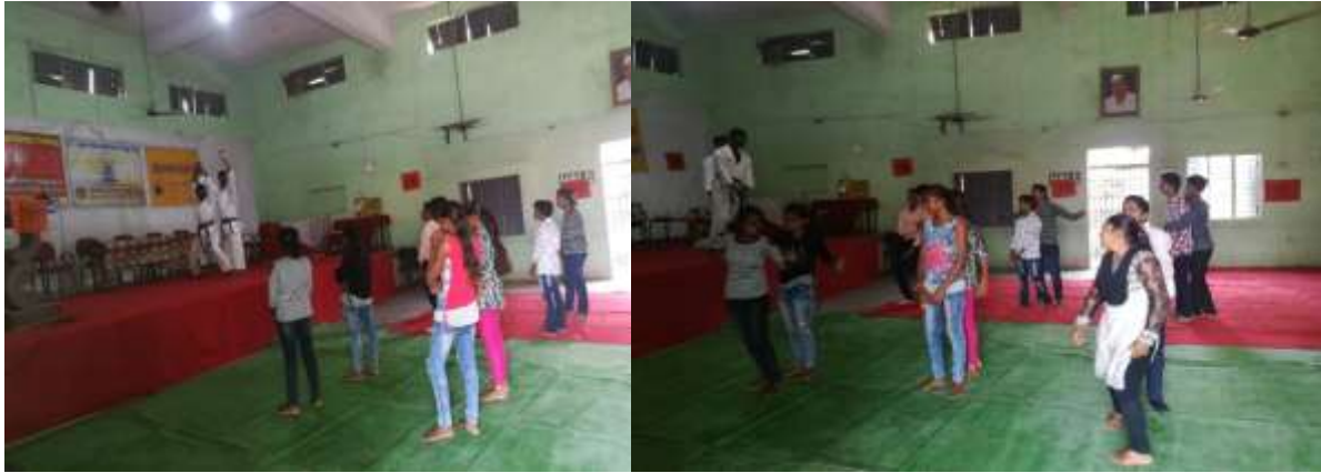
Disaster Management training program For NSS Students